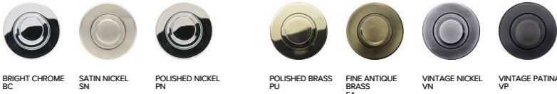
BRIGHT CHROME BC | SATIN NICKEL SN | POLISHED NICKEL PN | POLISHED BRASS PU | FINE ANTIQUE BRASS FA | VINTAGE NICKEL VN | VINTAGE PATINA VP