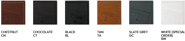
CHESTNUT CN | CHOCOLATE CT | BLACK BL | TAN TA | SLATE GREY GC | WHITE (SPECIAL ORDER) BW