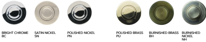
BRIGHT CHROME BC