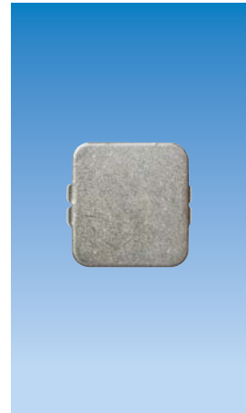
Planet stopping plate type 1, stainless