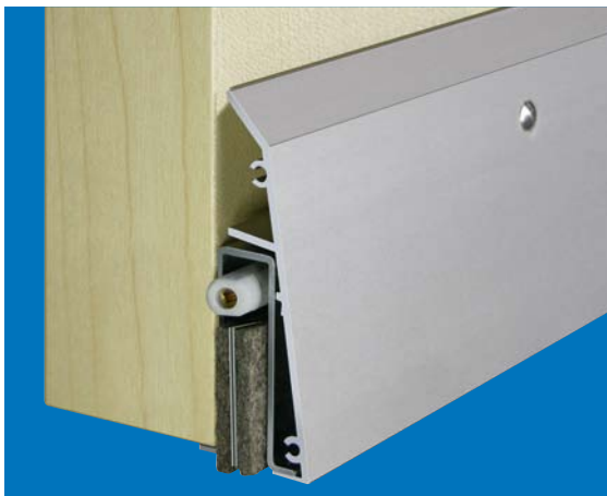
Option: Planet BL with Planet Socle