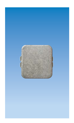
Planet stopping plate type 1, stainless