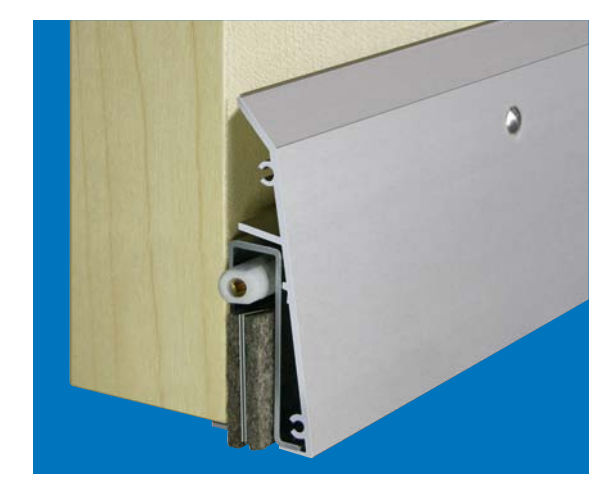
Option: Planet BL with Planet Socle