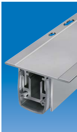
Planet R0 profile