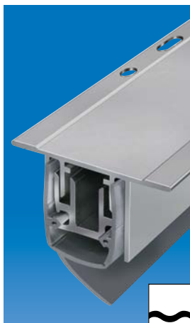
Option: Planet R0 bevel lip for wavy floors