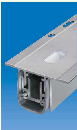
Option: Planet R0 with Drill hole 5×13 mm