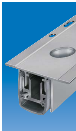
Option: Planet R0 with Drill hole Ø 10,8 mm