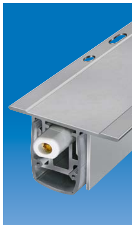
Planet R0 with release knob