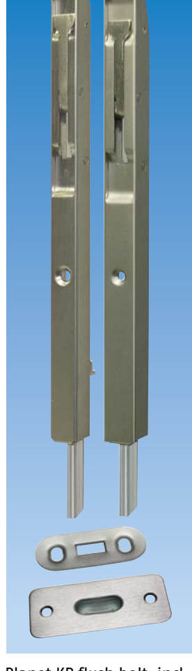
Planet KR flush bolt, incl. strike plate Option: floor recess plate 5×13 mm narrow