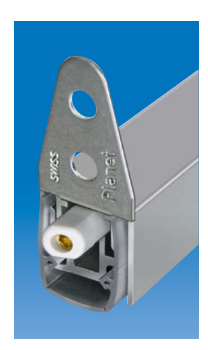
Planet MF with metal retaining bracket, release knop