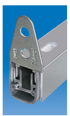
Option: Planet MF with Planet Drill hole 5×13 mm