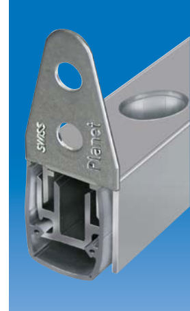
Option: Planet MF with Planet Drill hole Ø 10,8 mm