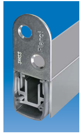
Option: Planet MF with retaining bracket for wooden doors