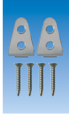
Planet assembly set MF for metal doors