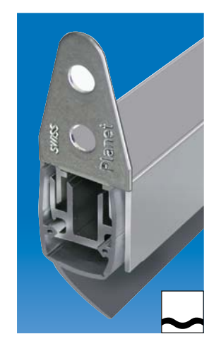
Option: Planet MF bevel lip for wavy floors