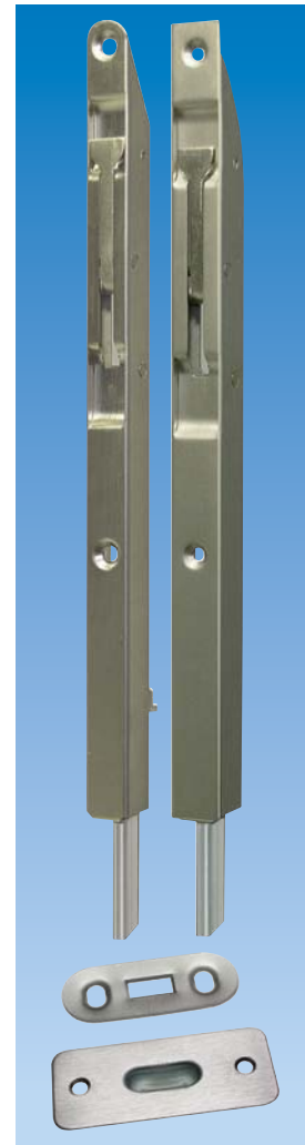
Planet KR flush bolt, incl. strike plate, refer to chapter Flush bolt | Drill hole.

Option: floor recess plate 5×13 mm, narrow