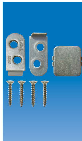
Planet assembly set HS