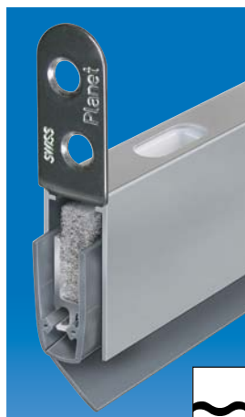
Option: Planet RH with Planet Drill hole 5×13 mm