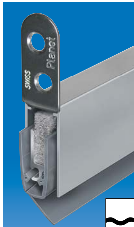
Planet RH profile