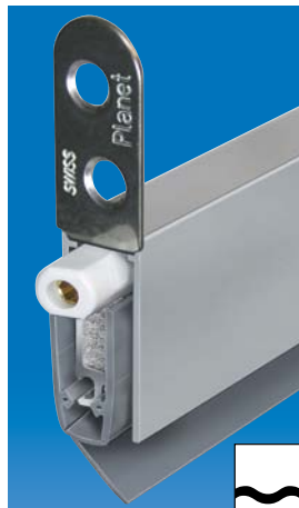
Planet RH with retaining bracket, release side