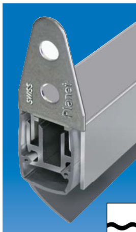
Option: Planet MF bevel lip for wavy floors