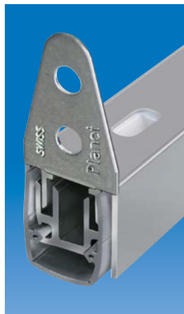
Option: Planet MF with Planet Drill hole 5×13 mm