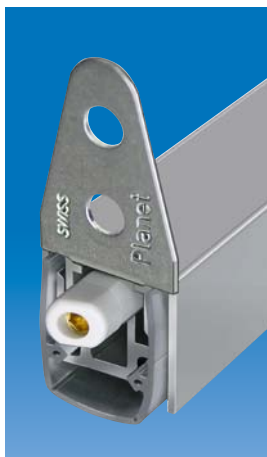
Planet MF with metal retaining bracket, release knob