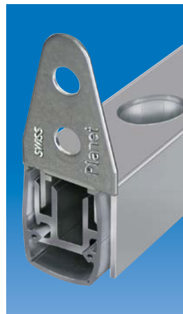
Option: Planet MF with Planet Drill hole Ø 10,8 mm