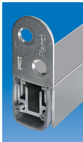
Option: Planet MF with retaining bracket for wooden doors