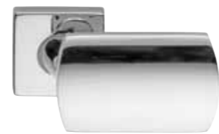
OC Cromo Chrome