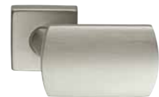
ONS Nickelsat Satin nickel