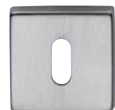
P014P - PCS