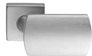
PCS Power cromosat Power satchrome