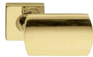
PVD Oro Gold