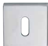
IN14P - OC